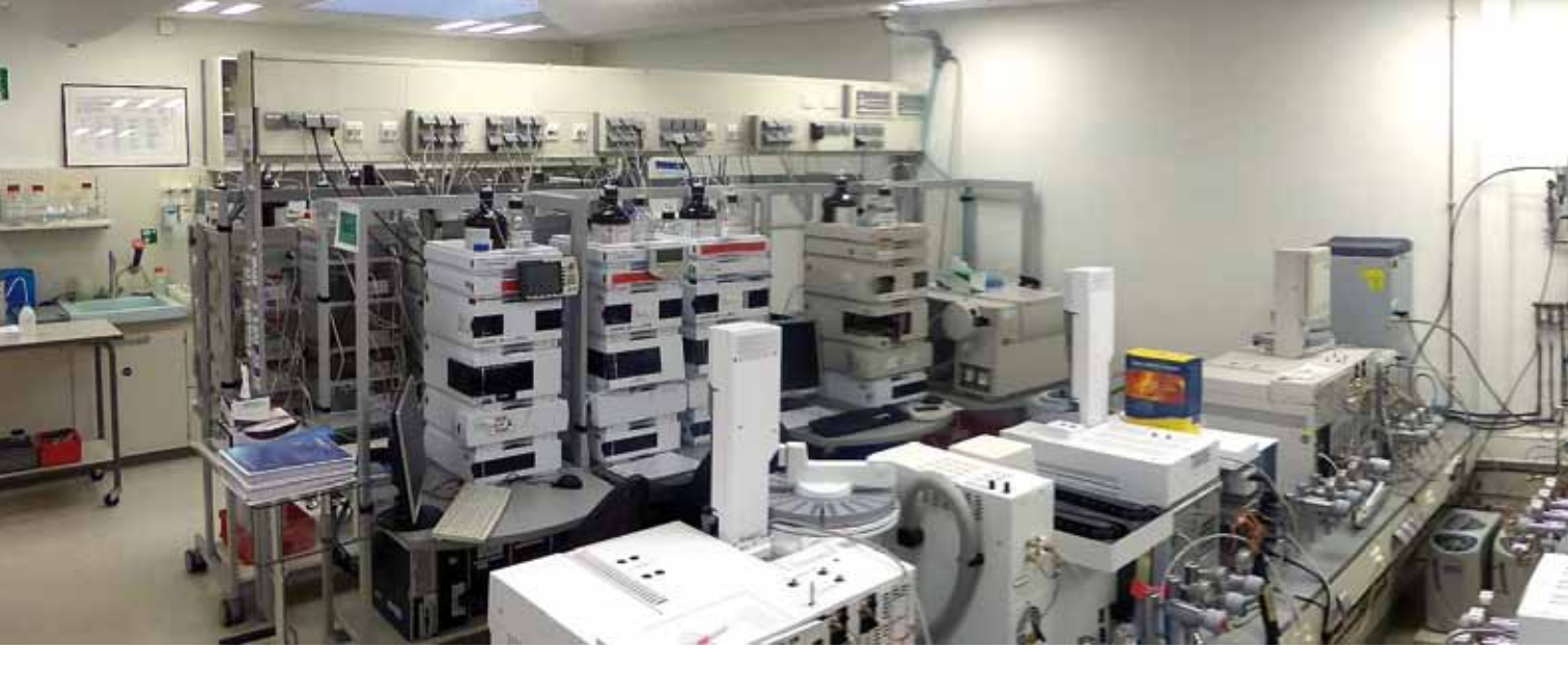
Inside the laboratories of Schülke & Mayr GmbH