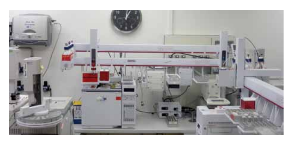
Every GERSTEL MPS in the Schülke & Mayr laboratories is equipped not only with a Weighing Option, but also with two towers (Dual Head version) in order to accurately dispense a wide range of volumes without having to go through the process of changing syringes. "The Bridge", an XL version of the MPS spans two GC systems. Prepared samples can be introduced to the GC on the left and vials with prepared samples can be placed into the autosampler of the GC on the right hand side.

as replacement of consumable parts can be scheduled. This helps to ensure that the laboratory always delivers reliable and accurate data. "Without a weighing option," says the expert, "A regular or ongoing system monitoring and control would never be this easy – or even possible."