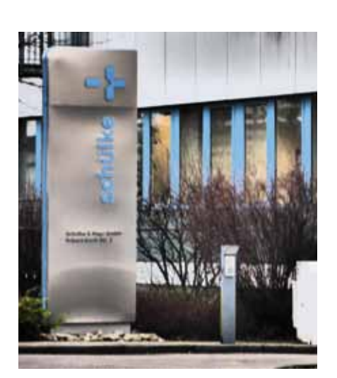
Schülke & Mayr Headquarters in Norderstedt near Hamburg, Germany.

Since the bulk of the products from Schülke & Mayr are used for medical, clinical or pharmaceutical purposes, the company is officially classified as a pharmaceuti-