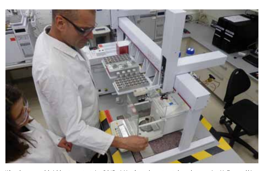
When they prepared their laboratory restructuring, Schülke & Mayr focused on automated sample preparation. Mr. Teevs and his team specifically wanted an autosampler with integrated weighing option that can dispense a wide range of volumes accurately and efficiently without time-consuming syringe changes while offering the possibility to monitor, control and document the dispensed volumes. They found all this and more in the GERSTEL MultiPurpose Sampler (MPS).