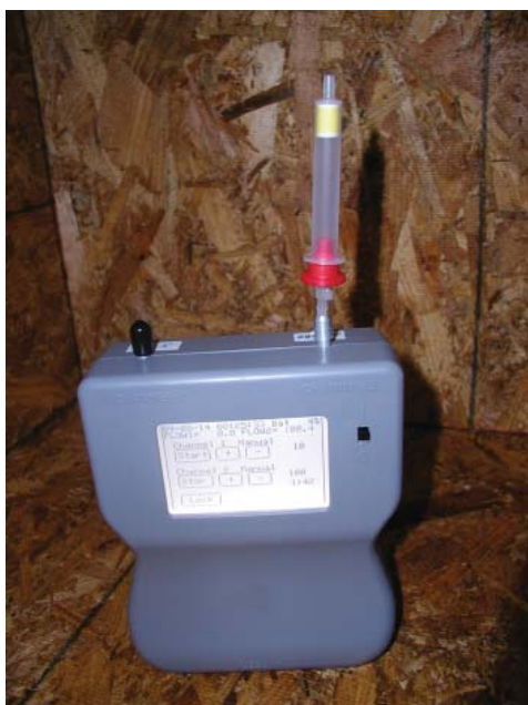
Figure 2. GERSTEL GSS hand-held sampler with a DNPH cartridge inside the plywood test chamber.

Figure 2 shows the GSS hand-held sampler with a DNPH cartridge inside the plywood test chamber.