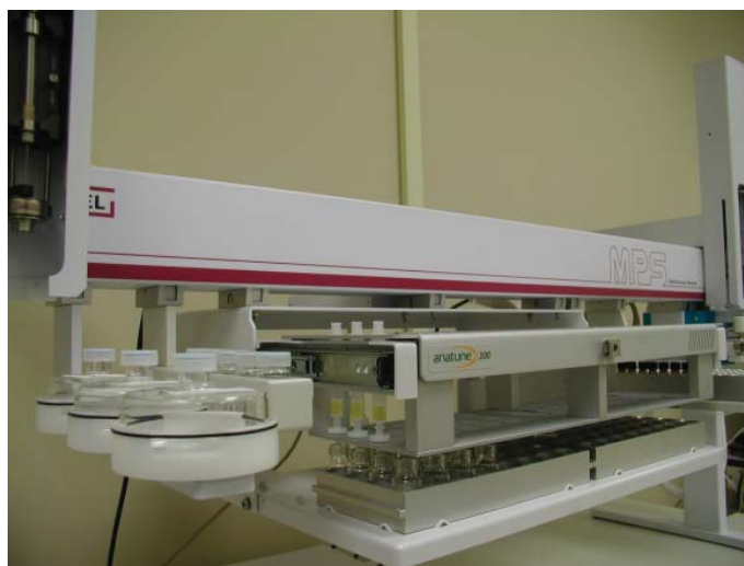
Figure 1. Dual-head MultiPurpose Sampler (MPS) configured with the A300 Automated DNPH unit.

Instrumentation. Automated desorption was performed using a dual-head GERSTEL MultiPurpose Sampler (MPS) configured with an A300 Automated DNPH unit from Anatune as shown in Figure 1. All analyses were performed using an Agilent 1290 binary pump and thermostated column compartment, an Agilent 1260 VWD, and a Sigma-Aldrich Ascentis Express C18 column (4.6 x 50 mm, 2.7 \mu m). An Agilent 6460 Triple Quadrupole Mass Spectrometer with Jet stream electrospray source was also configured in order to provide further identification of the DNPH-derivatives being monitored. Sample injections were performed using the GERSTEL MPS autosampler configured with an Active Washstation and a 6 port (0.25 mm) Cheminert C2V injection valve outfitted with a 10 \mu L stainless steel sample loop.