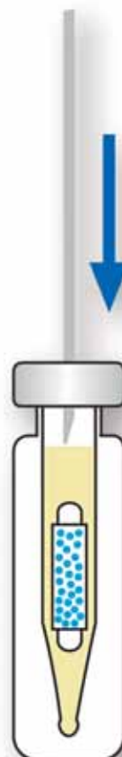
Addition of back-extraction solvent